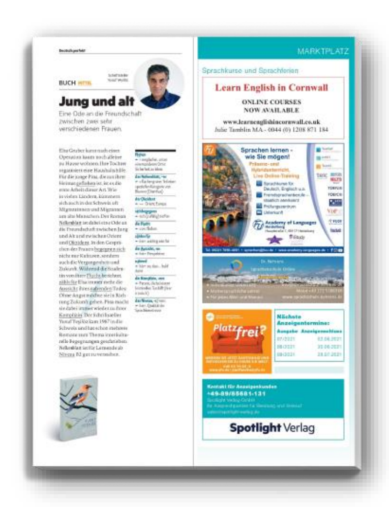
Sample classified ads.